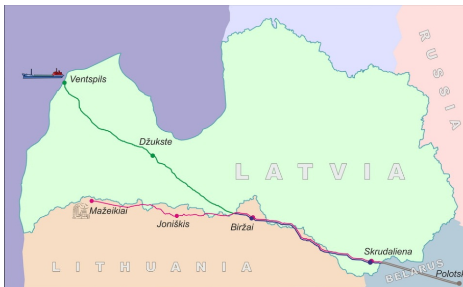
Fig. 1 - Pipeline routes

The crude oil transport through 28" pipeline system Polock – Ventspils and Polock – Mazeikiai on the territory of Lithuania, Latvia and Belarus was terminated more than 10 years ago. (See Fig. 1 - Pipeline routes.) These pipelines in the total length of almost 1000 km remained full of the oil containing about 2.4 million barrels of oil. This situation had very bad consequences for pipeline operators as their responsibility for costly maintenance and environmental risk in cases of pipeline damage caused by a corrosion or a third party remained. At the same time this situation prevented any other use of the pipelines like transmission of refined oil products or natural gas.