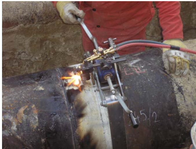
Fig.8 – Flame cutting at permanently explosion safe conditions

Pipeline conservation for the protection against a future corrosion was made in two steps.