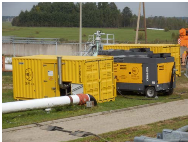
Fig. 9 – Production of nitrogen mixture on the jobsite

In the second phase after the chemical cleaning the pipeline was purged by the nitrogen mixture containing 95% of nitrogen. After that the nitrogen pressure in the whole pipeline system was increased to 3 bar. To do that CEPS used its mobile nitrogen units again (Fig. 9).