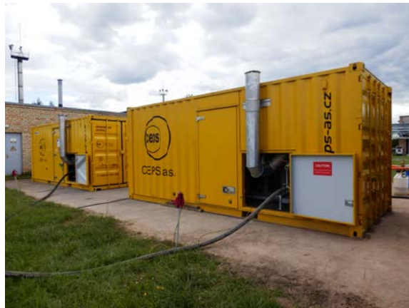
Fig. 3 – CEPS mobile nitrogen generators

2 pigs were inserted into each launcher and a water batches were created by pumping water in between them. These water batches were then propelled through pipeline sections by inert nitrogen mixture containing more than 90% of nitrogen. 2 CEPS mobile nitrogen generators produced sufficient volume of nitrogen to move the water batches and the whole content of the crude oil through the pipeline sections (Fig. 3).