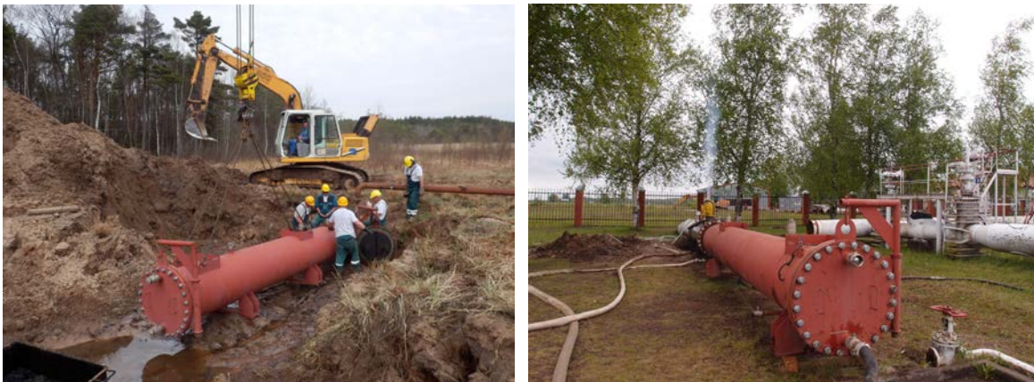
Fig. 4 and 5 – temporary traps for chemical cleaning

For the chemical cleaning special temporary CEPS launchers and receivers were fastened or welded to both ends of each cleaning section (Fig. 4 and 5).