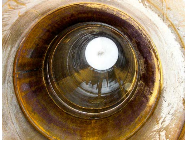
Fig.6 – Internal pipeline surface after chemical cleaning

Samples of water from the last water batch of each pig train were taken after its arrival to the receiver in order to establish the remaining content of hydrocarbons. The analyses done in an accredited testing laboratory never showed exceeding the concentrations required by local standards.