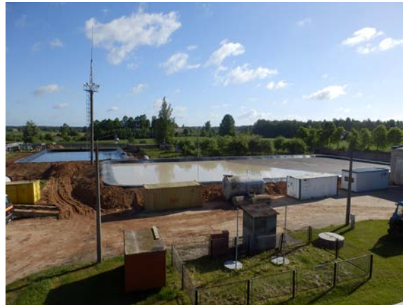
Fig. 7 – Temporary reservoirs