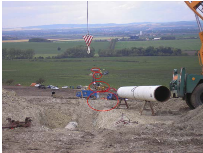
Fig.10 – Spread of some jobsites