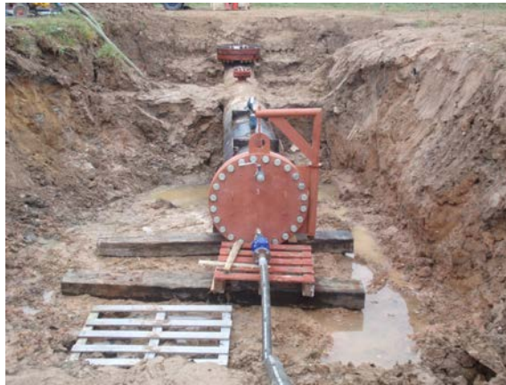
Fig. 2 – CEPS temporary launcher and customer HT&P fitting installed

Pipeline operators made all excavation and welding work as well as HT&P isolation of decommissioned pipeline parts by their own equipment and personnel.